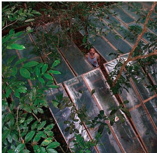
Parched. Thousands of panels prevented most rain from reaching the forest floor.

Nepstad got the idea for the experiment while working in the eastern Amazon in 1992 during